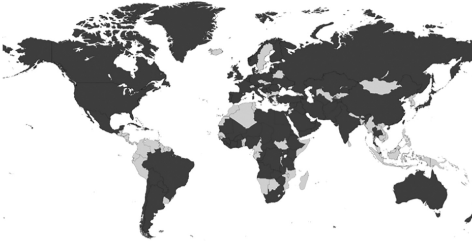
Figure 1. States That Have Recruited Legionnaires.

NOTE: States shaded in black represent countries that have recruited legionnaires. Map created by author using mapchart.net.